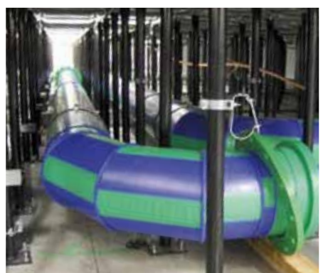
UNITECH Attendorn, Germany